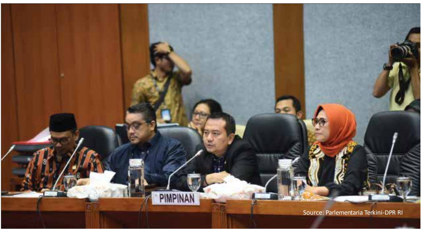
Chairman of Commission X Meeting

The first finding of this research is the view of DPR members on the problems in religious education. Approximately 47 percent of DPR members (or the respondents) stated that there is a problem in the implementation of religious education, while the other 53 percent stated there is no problem in that kind of education.