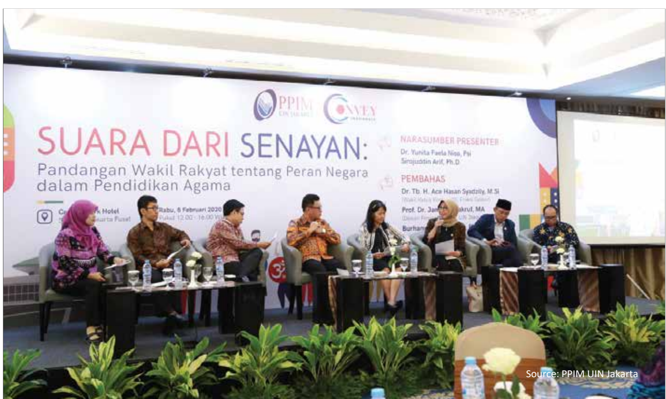
The Launching of Census Findings by PPIM

Since it was considered to be the authority of the school or even a personal matter.